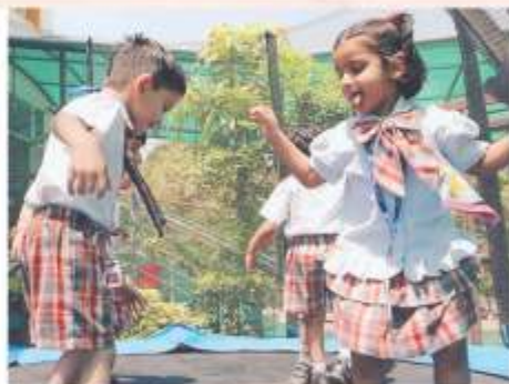
Play Time - fun Time