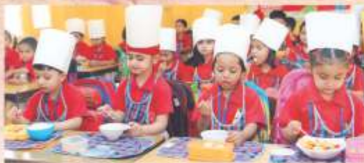
Relishing fruit salad-Fruit Party