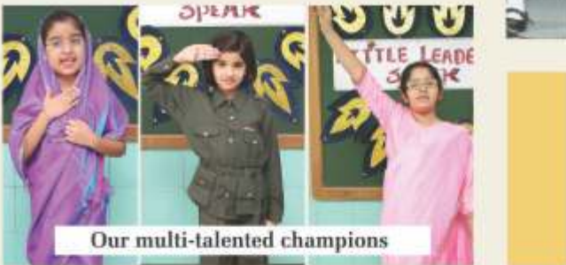
Our multi-talented champions