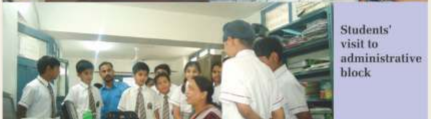
Students' visit to administrative block