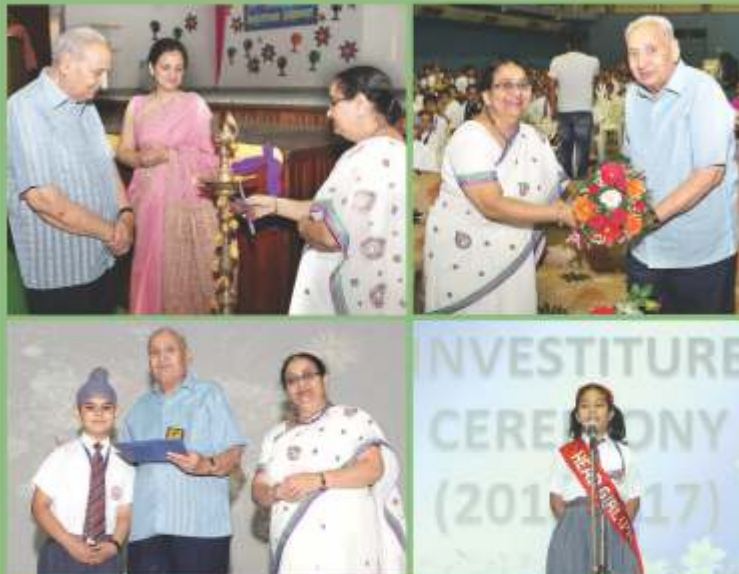
Where the 'Heads' are held high