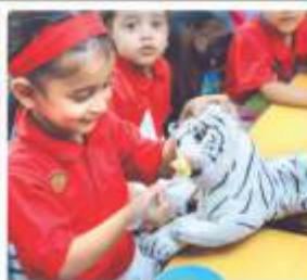
Feeding her pet