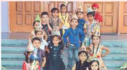
We love to party