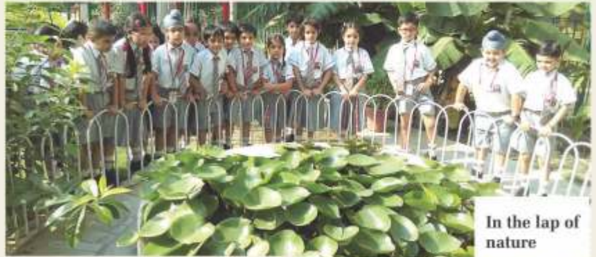
In the lap of nature