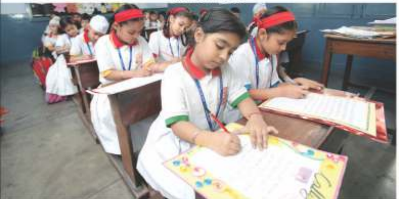
Writing in Style - Calligraphy Competition