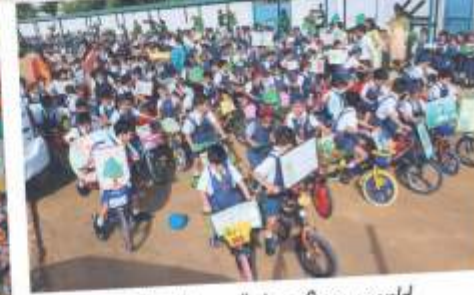
Pedal for pollution free world