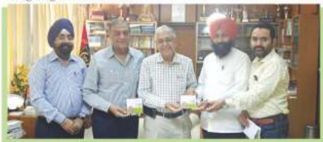
Interaction with Vice Chancellor, Panjab University