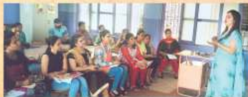
Interactive Session - Acquainting parents with teaching strategies