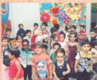
BCM Aryans twisted their toes