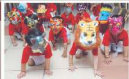
Animal Protection Day- A ride in Jungle Safari