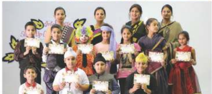
A smile is a medicine of life - Stand up comedian