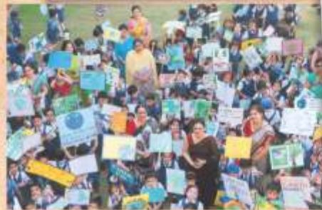
The 'Go Green' appeal