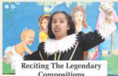
Reciting The Legendary Compositions