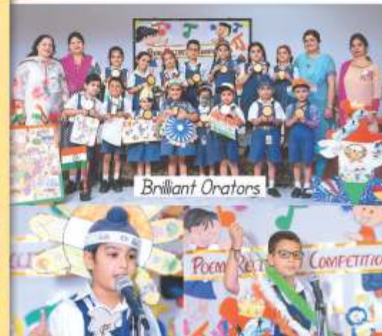
Poetry in Voice