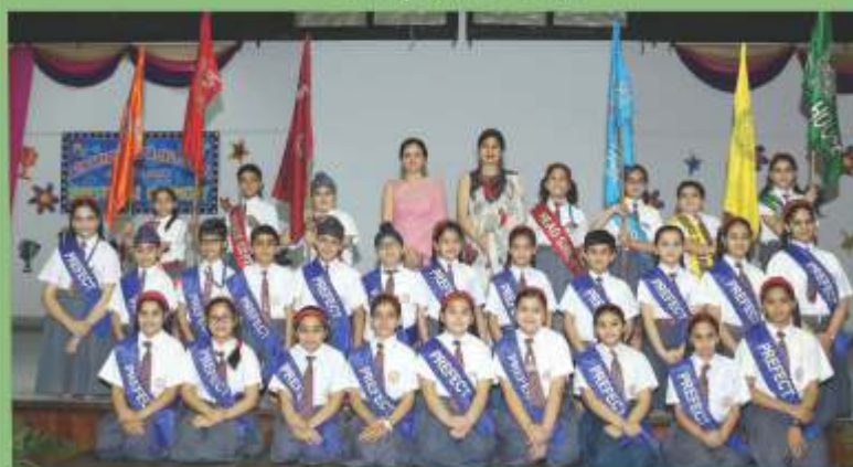
Visionaries and torch bearers of tomorrow