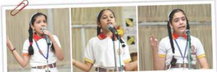
Evoking concerns for global problems