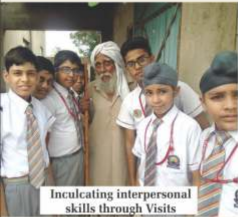
Inculcating interpersonal skills through Visits