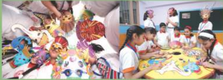
Treat to eyes (mask making)