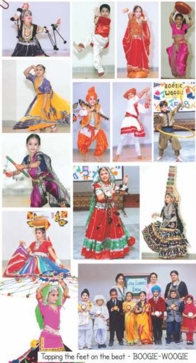
Tapping the feet on the beat - BOOGIE-WOOGIE