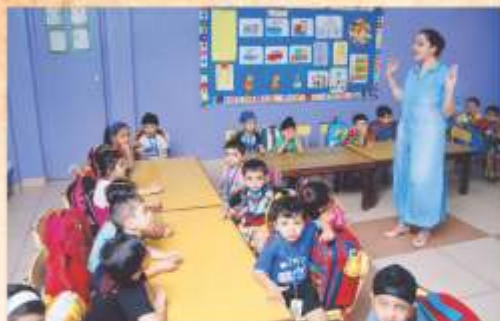
Guest Lecture - Parents's endeavour