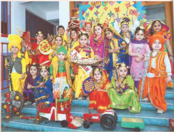
Baisakhi - Celebrating the harvest Festival