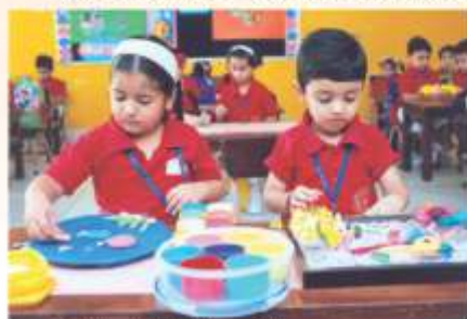
Clay Modelling - Showcasing art of sculpting clay