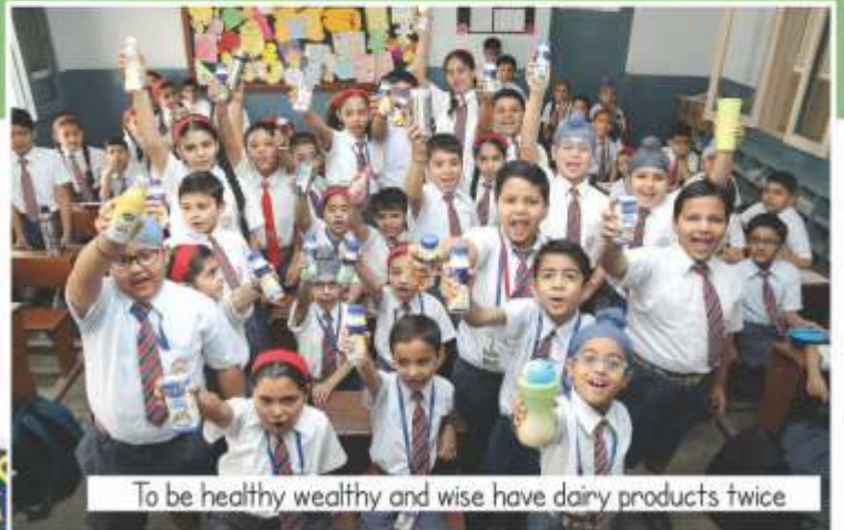
To be healthy wealthy and wise have dairy products twice