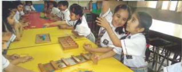
The fun way to learn calculations