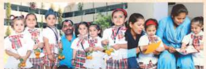
Labour Day-Our support system-We Love You