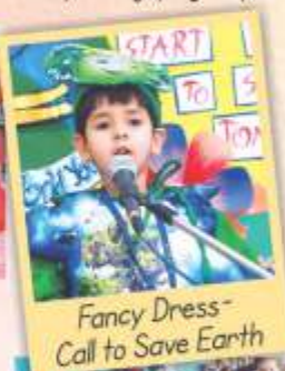
Fancy Dress - Call to Save Earth