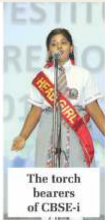
The torch bearers of CBSE-i