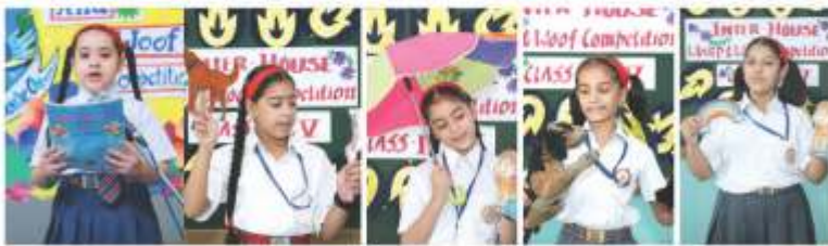
Imagination and Expressions are their Passion- Warp and Woof