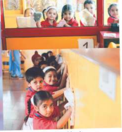
Helping Hand Activity- Lending a Helping Hand