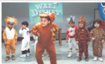
Showing unconditional love for their animal friends