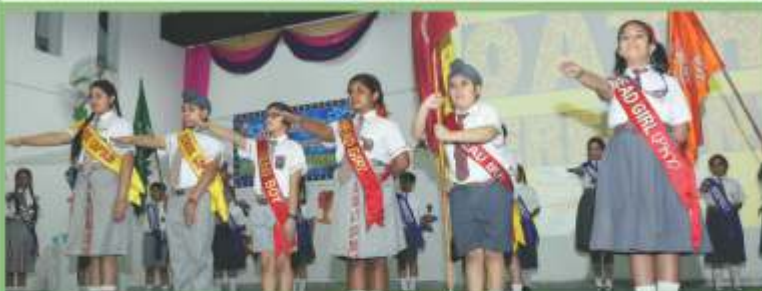
Taking Oath of office