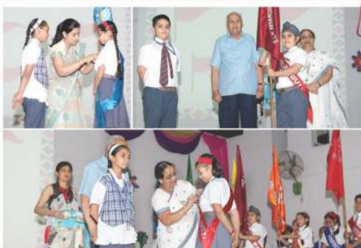
Bestowed with the responsibility