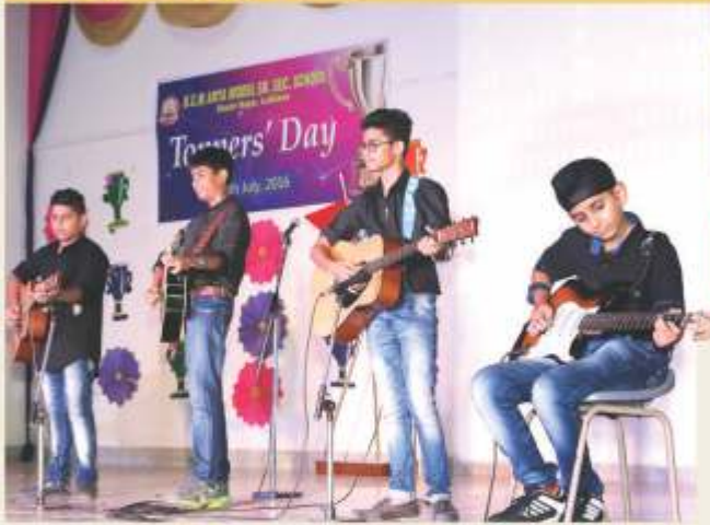
Performing to the Tunes of Melody