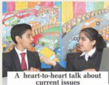
A heart-to-heart talk about current issues