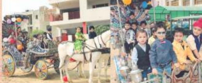
Freshers' Party - Enjoying Royal Ride