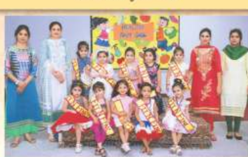
Fit 'n' fine healthy baby show Winners ....