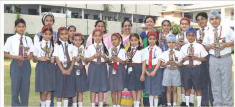
Winners of All Punjab Preliminary Round Abacus Competition 2016

BCM Aryans excelled at All Punjab Preliminary Round Abacus Competition 2016 held in Amritsar on 1st May, 2016. Out of total 80 students who participated, 22 students of our school bagged top honours.