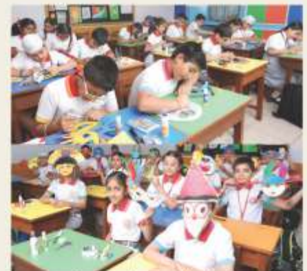
Innovation at its Best