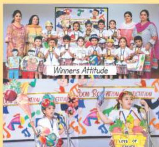
LKG Poem Recitation - Lifting the harmful effects of junk food