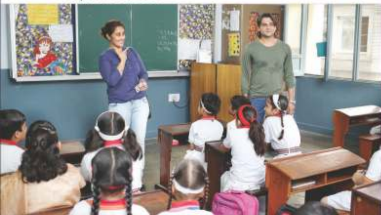
Parents as Partners - Guest Lecture