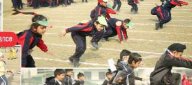
I can go the distance