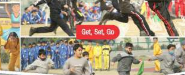
Get, Set, Go