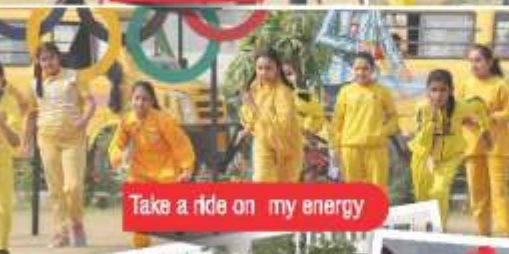
Take a ride on my energy