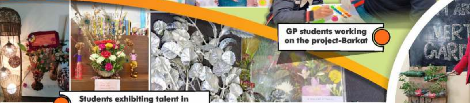
Students exhibiting talent in Flower Show-Awesome Blossom