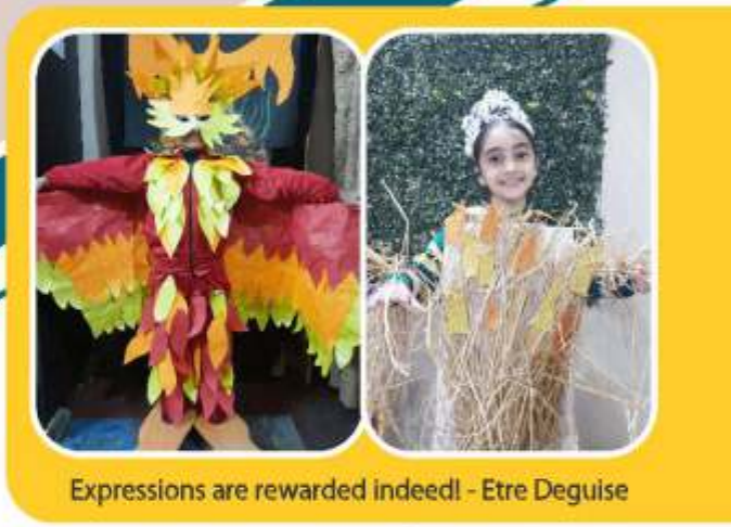
Expressions are rewarded indeed! - Etre Deguisse