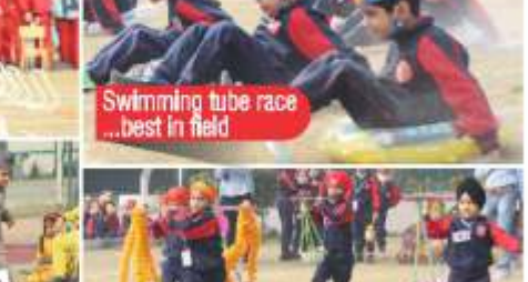
Fast 'n Furious