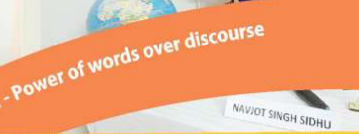
MUN - Power of words over discourse