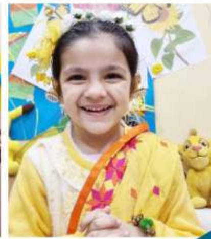
Depicting the colour of festivity-Basant