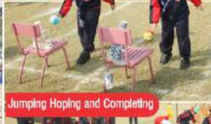
Jumping Hoping and Completing