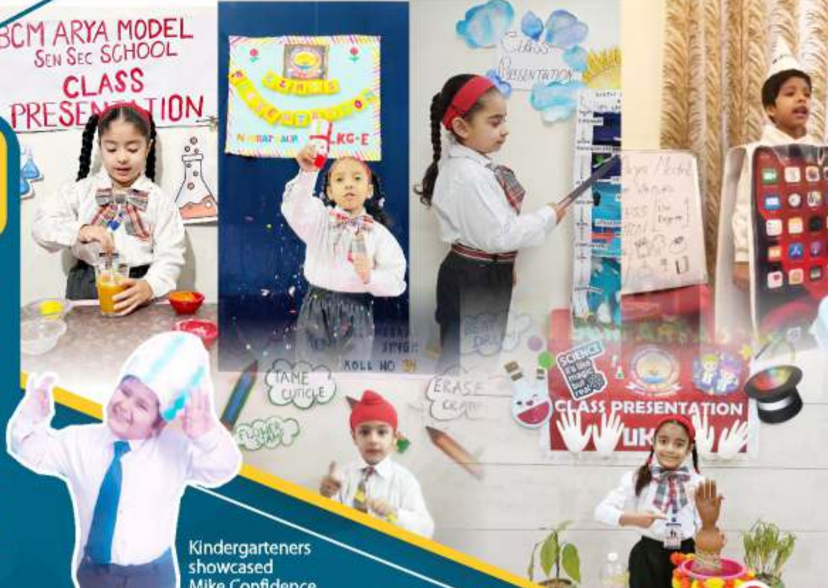
Kindergartners showcased Mike Confidence

We always thrive to cater to allround development of our students and our main focus has always been on improving the soft skills amongst the students. With this intention in mind, Virtual Class Presentation- 'Own the Mic' was held for Kindergarten students. The 3-day long Annual feature witnessed high levels of self-confidence and leadership skills of about 1200 students from Nursery to UKG.