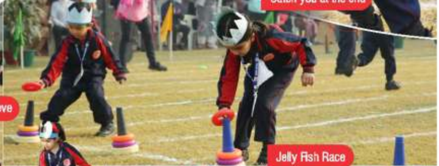
Jelly Fish Race