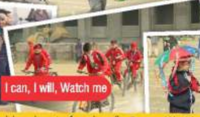
I can, I will, Watch me