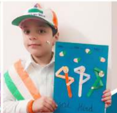
Young ones giving tribute to motherland