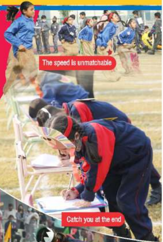
The speed is unmatched

Our school is always instrumental to infuse the spirit of sportsmanship in the hearts and minds of B.C.M. Aryans. Annual Athletic Meet was organised for the students of KG and Primary classes. The school playground was filled with great zeal, excitement and frolicsome atmosphere. The athletic meet saw participation of more than 3000 students in wide range of track and field events which included many innovative races like Jeet Jayega India, Gomato Race, Believe to Achieve, Dress to Impress, Shopping Race, Harry Potter Race, Pop the Balloon Race, Hurdle Race, Sack Race etc. Once the races began, the air was filled with cheering and tons of encouragement for the young athletes. The event was filled with sportsmanship, enthusiasm, exciting victories, near misses and a number of memories to cherish.