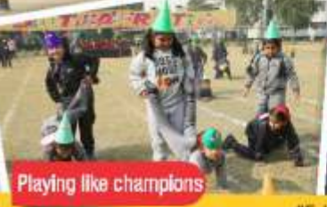
Playing like champions