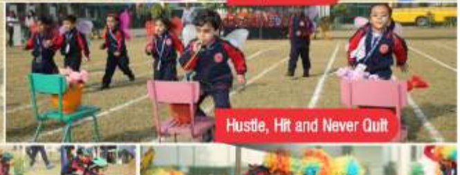
Hustle, Hit and Never Quit