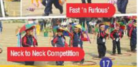
Neck to Neck Competition