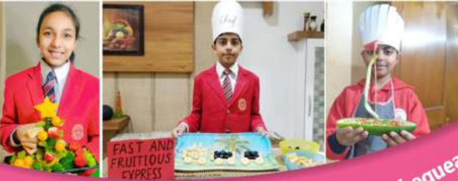
Salad Making – Incipient culinarians bequeathing veggie vibes