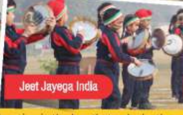
Jeet Jayega India