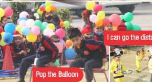
Pop the Balloon